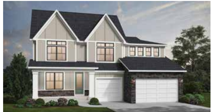
ELEVATION B ■ ■ ■ ■