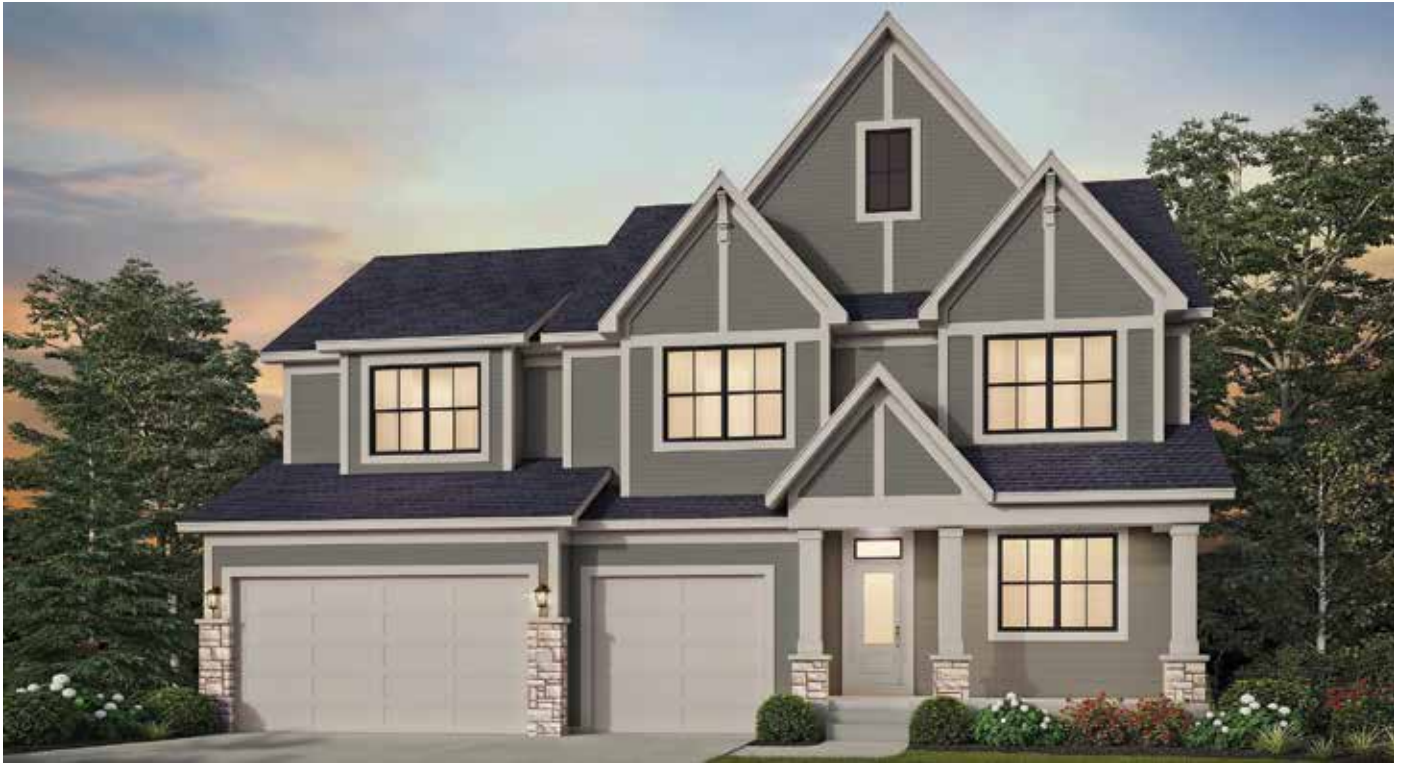
ELEVATION D ■ ■ ■ ■

4 - 6 BEDROOM 5 BATHROOM 5,007 - 5,259 FINISHED SF