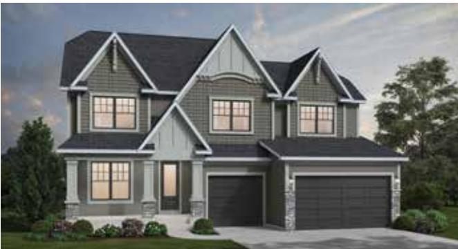
ELEVATION E ■ ■ ■ ■