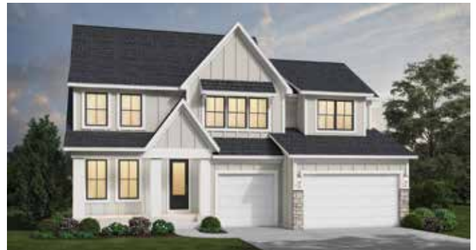
ELEVATION A ■ ■ ■ ■