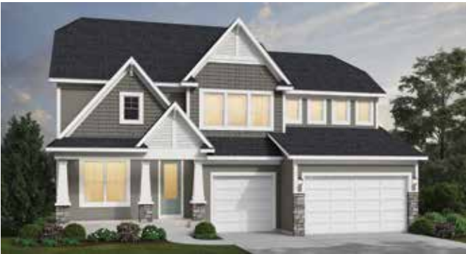
ELEVATION C ■ ■ ■ ■