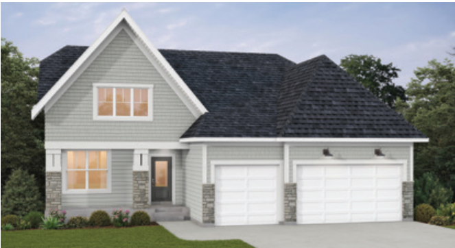
ELEVATION B ■■■■