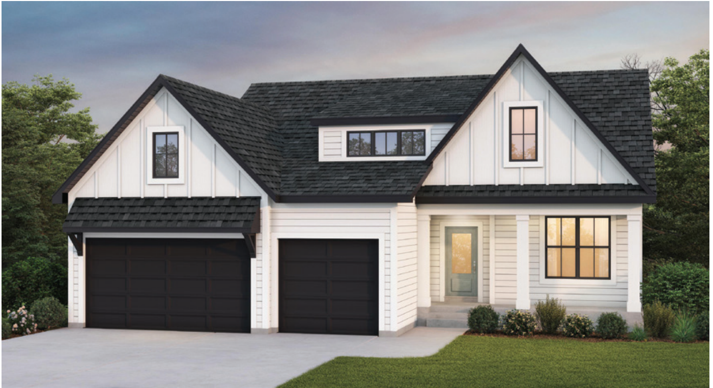
ELEVATION A ■■■■

4 BEDROOM 3 BATHROOM 2,953 - 3,097 FINISHED SF