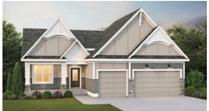
ELEVATION C ■■■■